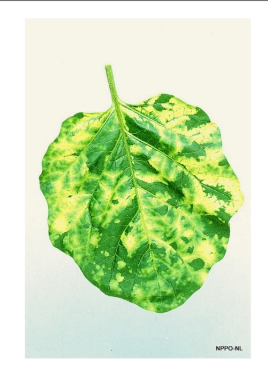
FIGURE 14 Mosaic on Solanum melongena