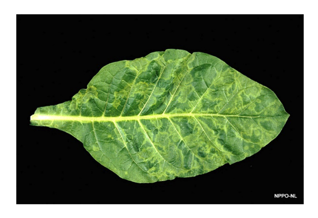
FIGURE 6 Chlorotic patterns on Nicotiana tabacum cv. White Burley