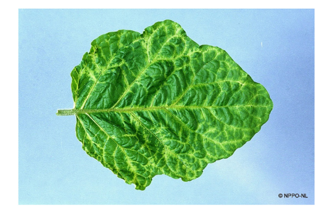
FIGURE 24 Vein clearing (chlorosis) on Solanum melongena