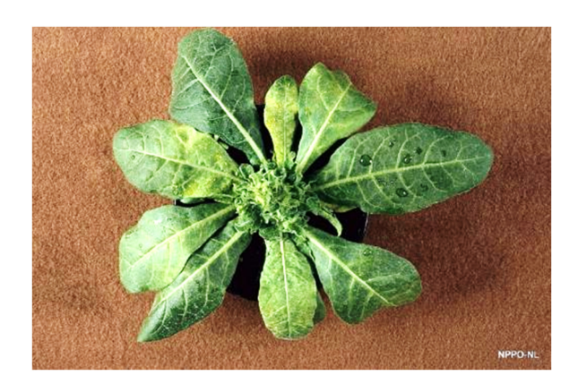
FIGURE 8 Stunting on Nicotiana occidentalis Pl