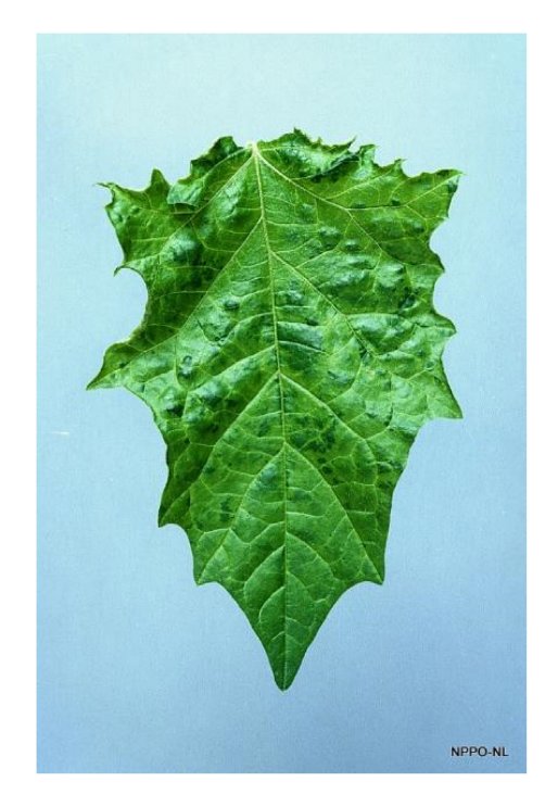
FIGURE 2 Blistering on Datura stramonium