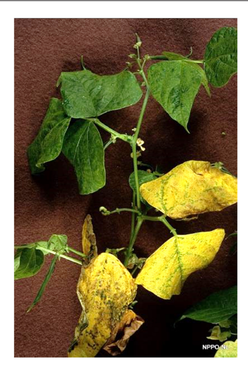
FIGURE 3 Chlorosis (yellowing) on Phaseolus vulgaris