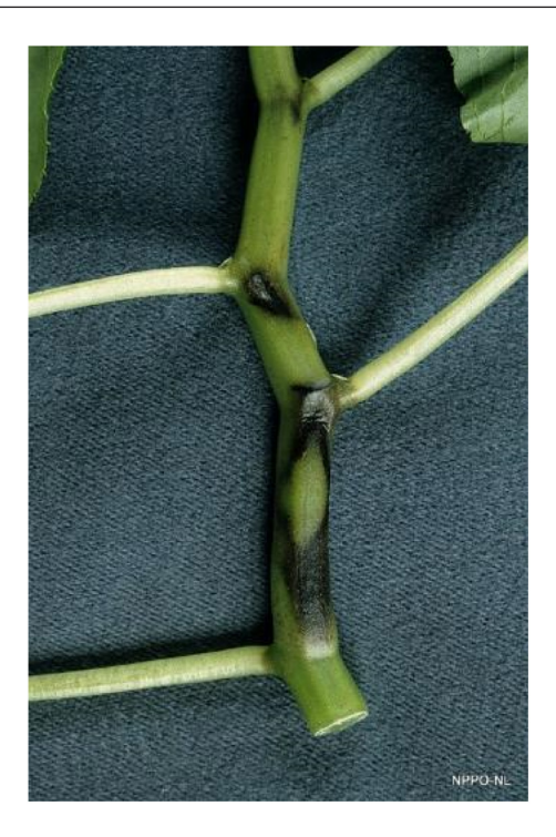
FIGURE 22 Stem necrosis on Impatiens sp.