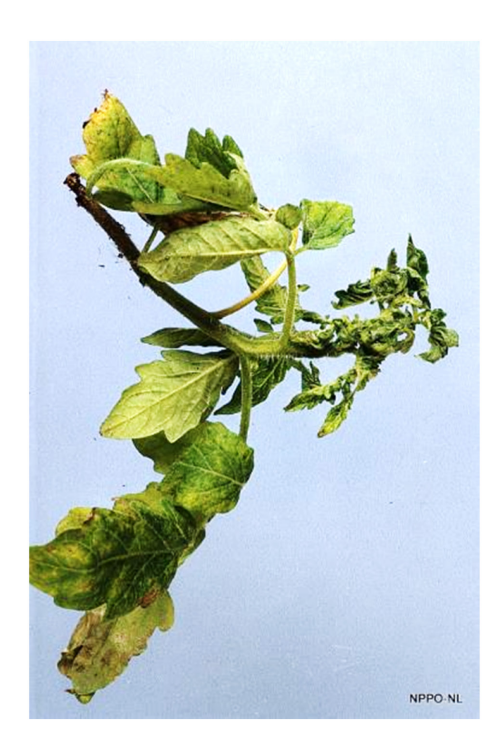
FIGURE 13 Leaf malformation on Solanum lycopersicum