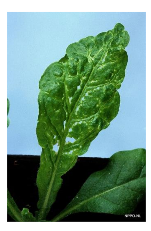
FIGURE 21 Shot hole on Nicotiana occidentalis Pl