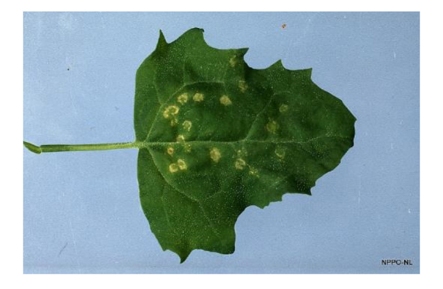
FIGURE 18 Necrotic rings on Chenopodium quinoa