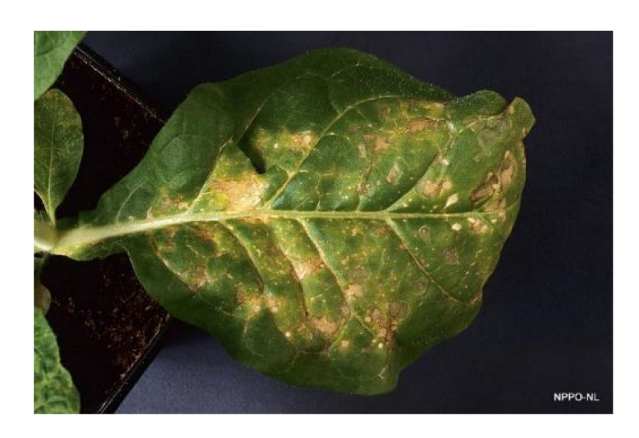
FIGURE 19 Necrotic zones on Nicotiana tabacum