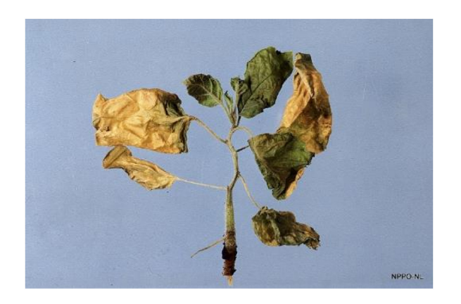
FIGURE 16 Necrosis on Datura stramonium