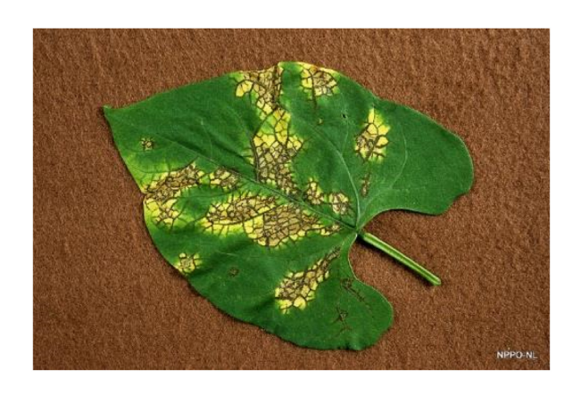
FIGURE 25 Vein necrosis on Phaseolus vulgaris