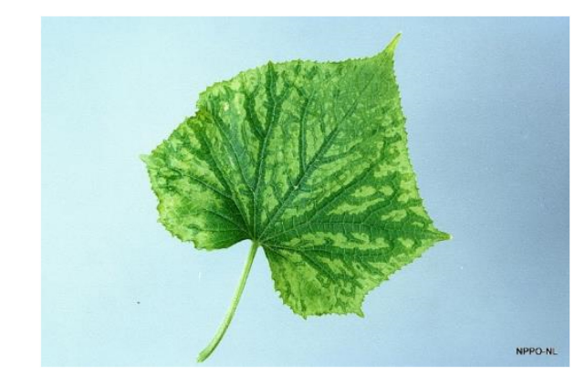
FIGURE 10 Interveinal chlorosis on Cucumis sativus