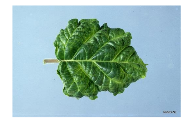
FIGURE 20 Rugosity on Datura stramonium