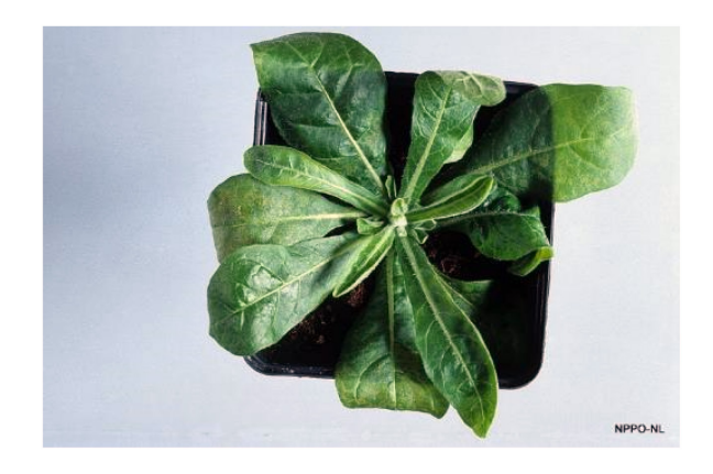
FIGURE 12 Leaf curl on Nicotiana occidentalis P1