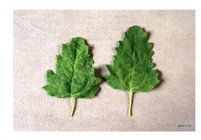
FIGURE 15 Mottle on Chenopodium quinoa