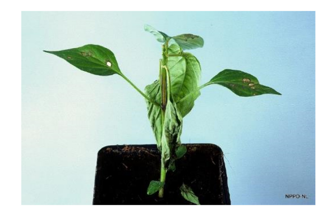
FIGURE 26 Wilting on Capsicum annuum