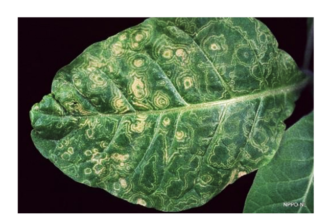
FIGURE 7 Concentric rings (and patterns) on Nicotiana tabacum cv. White Burley