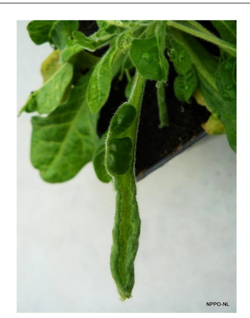
FIGURE 1 Blisters on Nicotiana occidentalis Pl

Note that Descriptions of Plant Viruses (DPV: https:// www.dpvweb.net/) provides information on suitable test plant species and (characteristic) symptoms for individual viruses.