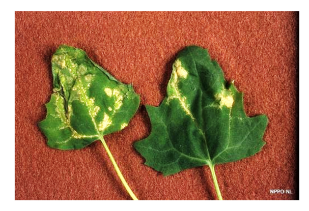
FIGURE 11 Irregular necrotic lesions on Chenopodium quinoa