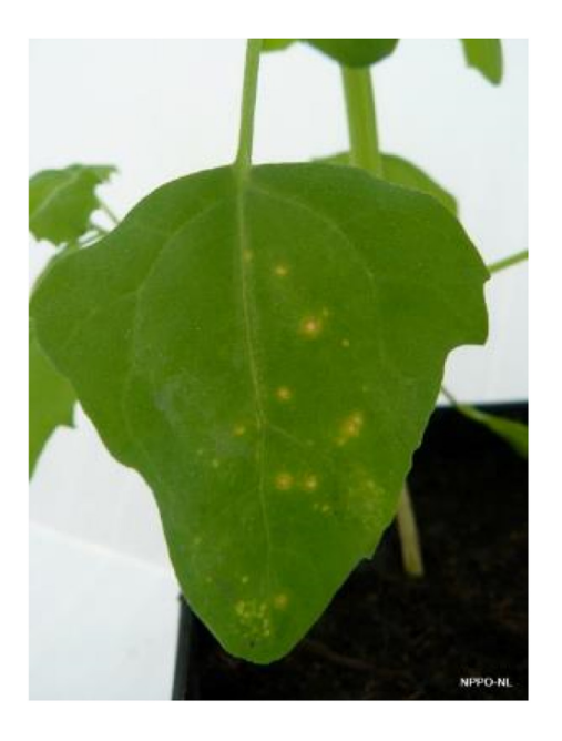
FIGURE 17 Necrotic lesions on Chenopodium quinoa