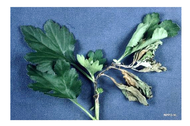
FIGURE 23 Top necrosis on Chrysanthemum sp.