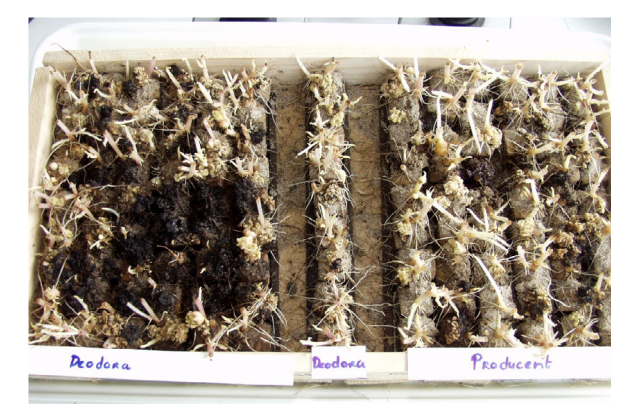
Fig. 7 Tray containing eye plugs of varieties Deodara and Producent, 8 weeks after inoculation. Note: the black-coloured tissue, especially in left-side Deodara, is decaying warts (reaction type 5).

8 cm long) are cut down to 1-2 cm. The side sprouts are cut down to 2-3 cm after another 8-10 days, and twice more after sprouts have again attained a length of 8-10 cm. The first small warts on the positive control usually appear after 4-5 weeks of incubation (Fig. 7).