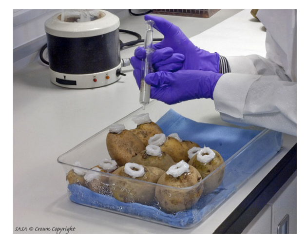
Fig. 5 Ringing of the sprouts with melted Vaseline before inoculation.

After the third centrifugation the liquid is left to rest for about 20 min until a distinct layer of spores has formed on the surface. This layer is removed with a cut-off pipette tip and passed through a funnel laid out with filter paper (Whatman "hardened 50") to collect the spores. Allow spores to dry in the fume hood before transferring the extracted spores to glass bottles for storage. The dry spores can be stored at room temperature for at least 5 years.