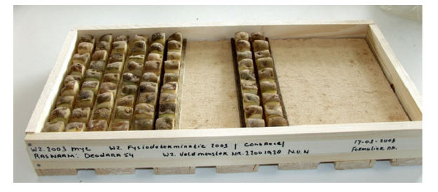
Fig. 6 Tray with cardboard plate inside containing potato eye plugs.

The distance between rows is approximately 5 mm, and within the row is approximately 1 mm (Fig. 6). The plugs are moistened with a fine mist of water, after which 1.0-1.5 g of inoculum per plug is placed on top of the eye. Inoculated plugs are again moistened and placed in a controlled environment at 16-18°C in the dark. Boxes may have a lid placed on them to avoid eye plugs from drying out. Relative humidity in the controlled environment should be high (a minimum of 85-90%). During incubation, the boxes with the plugs are moistened daily with a fine water mist, just sufficient to keep them moist (not wet). After approximately 10-15 days, the main sprouts (by then 6-1