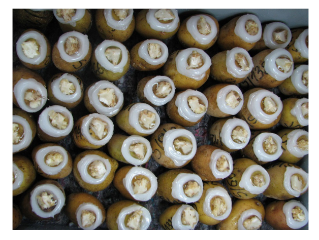
Fig. 3 Inoculation: pieces of fresh warts are cut into pieces and placed in the water-filled Vaseline rings.

The tubers are regularly sprayed with water and the boxes are covered to maintain a high humidity. After incubation for 2 days the warts are removed and kept for the next infection cycle. Depending on the quality of the warts, it is possible to reuse them up to four times to induce new infections. Subsequently, the eye plugs (or entire tubers) are placed in a new box, covered with peat or sand and cultured at 16–18°C. The boxes are regularly sprayed with water.