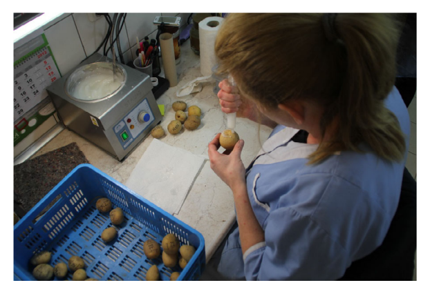
Fig. 1 Ringing sprout with Vaseline.

The tubers are washed in tap water if necessary to remove soil. Tubers are incubated at room temperature in darkness or dim light to promote sprouting. They are incubated until sprouts reach 1–2 mm. It is possible to use entire tubers or cut eye plugs (approximately 3 \times 3 \times 2 cm) containing developing sprouts that are 1–2 mm in length. Subsequently, the sprouts are ringed with warm Vaseline using a syringe without a needle (Fig. 1). The eye fields are stored for a short time or overnight so that the Vaseline solidifies.