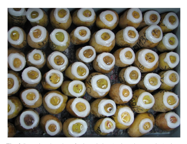
Fig. 2 Preparing the tubers for inoculation (entire tubers version): rings are filled with water to cover the sprout.

If entire tubers are used, encircling the sprout with marker pen beforehand facilitates the recognition of inoculated sprouts after the petroleum jelly has been removed at a later stage.