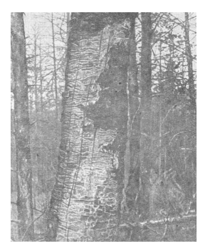
Fig. 2 Larval galleries of Xylotrechus altaicus on larch.

This species prefers to attack mature trees and, even in cases when it does not kill them, the infestation results in significant loss of vigour and of wood marketability (because of the bore holes). The most severe damage is usually observed in larch forests previously attacked by Dendrolimus sibiricus (OEPP/