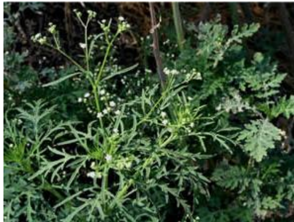
Parthenium hysterophorus