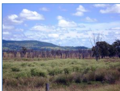
Fig 3: Invasion of Parthenium hysterophorus in pastures in Queensland ( http://www.getfarming.com.au )

Though, impacts on crop yield and/or quality depend upon the production used, as P. hysterophorus impacts may be kept to an acceptable level in intensive production areas, but can be major in extensive production areas.