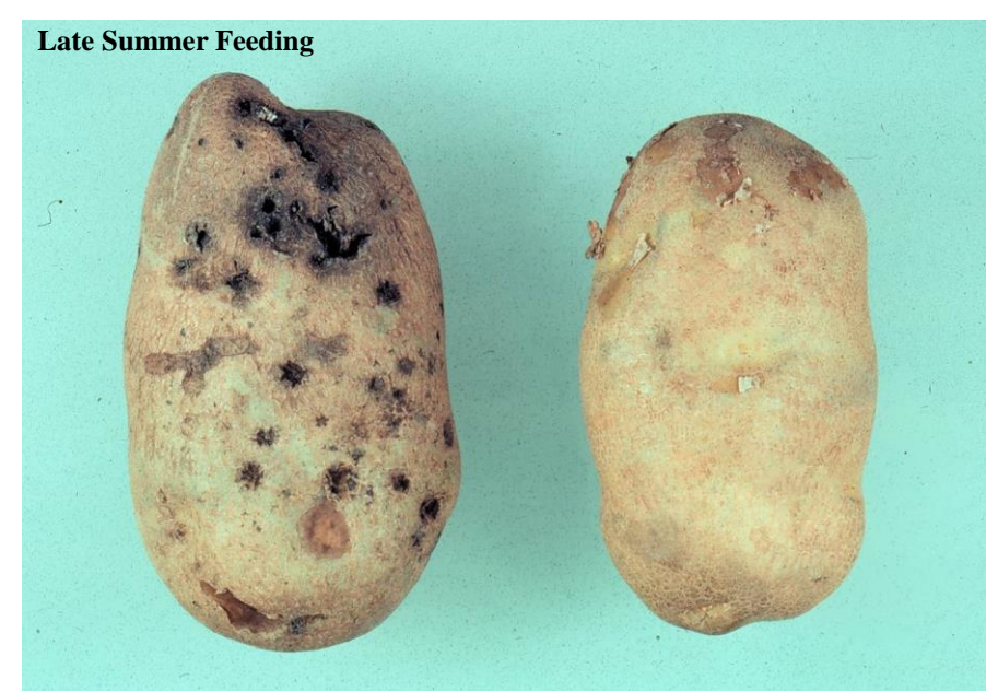
Potato tuber showing tunnels due to larvae of E. tuberis. Vernon, Agriculture Canada (CA)

Leaf damage can also lead to a yield reduction (up to 15% for E. cucumeris, Senanayake et al., 1993), in particular if potato plants are already stressed by defoliation due to other pests or by drought.