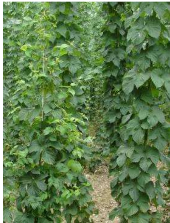
Infected plants fail to reach the level of the trellis, and certain varieties begin to blossom even up to 10 days prior to the uninfected plants.