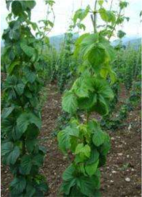
Infected hop plants with visible symptoms of stunted and poor growth, yellowing and leaf curling down.