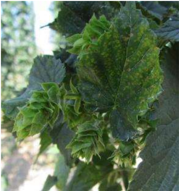
Lateral shoots have shorter internodes and abnormal growth of cones.