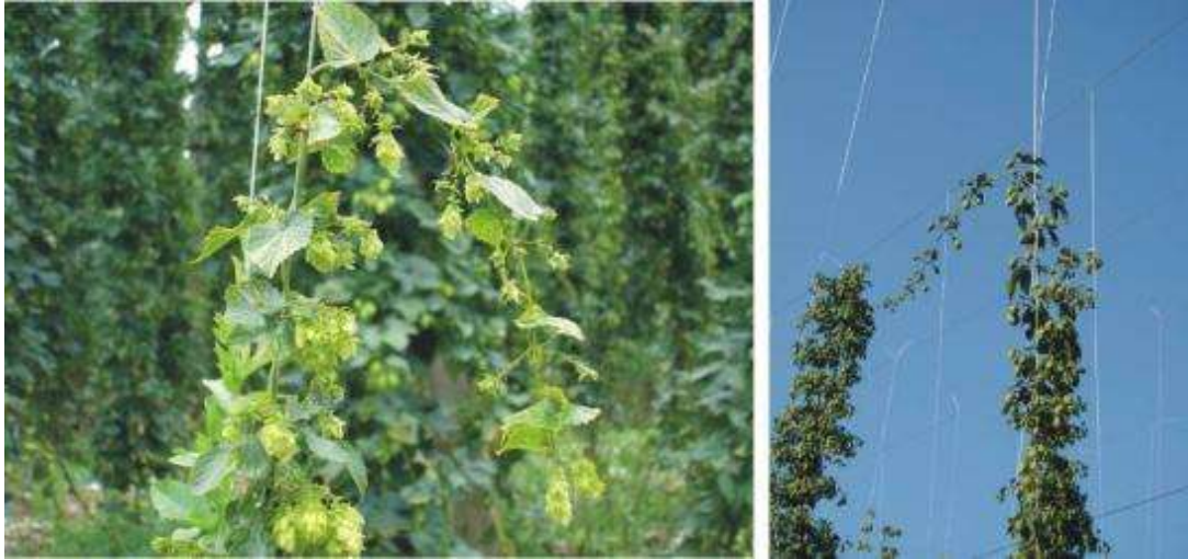
Infected plants decline from the support and their climbing upwards thereupon is aggravated