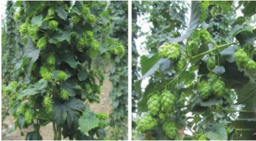
Hop cones on infected (left) and uninfected (right) plant of variety Celeia.