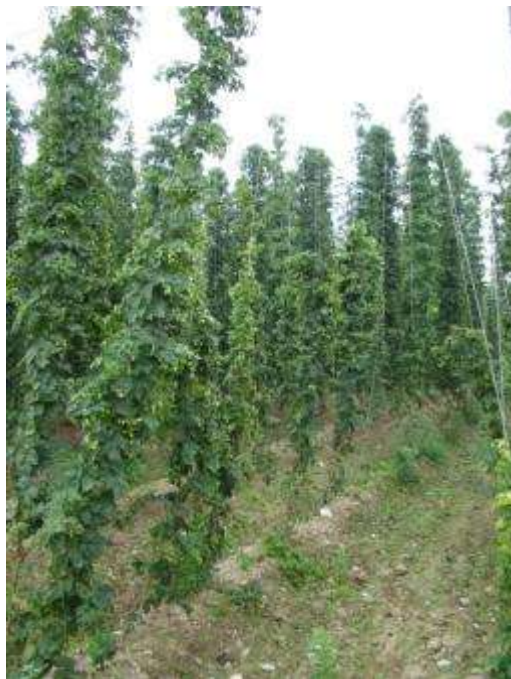
Foci of infected plants with spreading pattern along the rows.