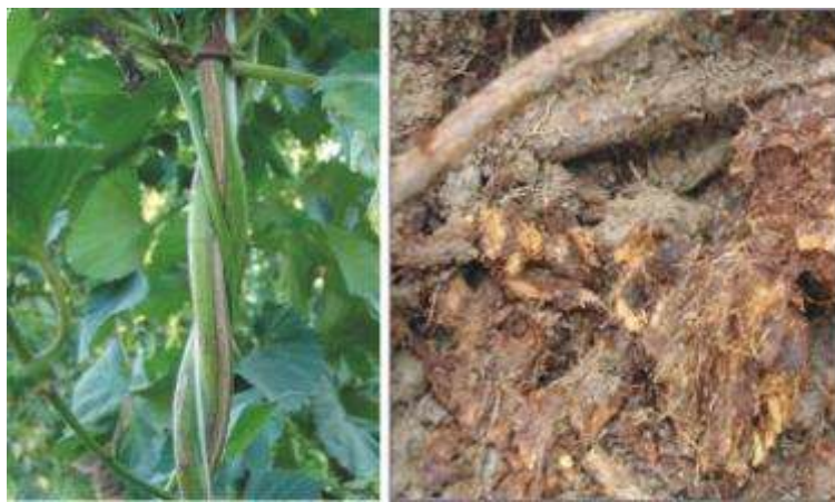
Intensified cracking of primary vine and dry rot developing on infected plants.